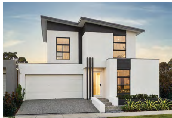
The Style House