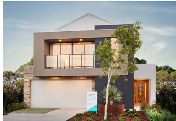
The Art House