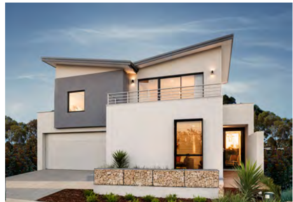
The Beach House